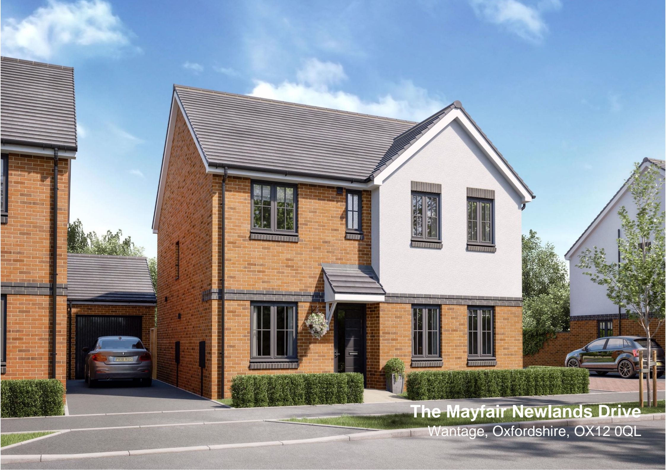
The Mayfair Newlands Drive Wantage, Oxfordshire, OX12 0QL